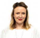
Bethan Sayed MS Plaid Cymru

The following Member was also a member of the Committee during this inquiry.